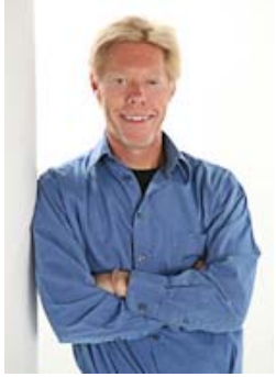
All Publisher's Blogs

No matter what the economy, there are always companies that belie current conditions - successes during recessions and failures in boom times. [more]