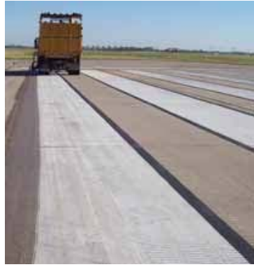
Removal of runway markings was an important step in recent reconstruction and rehab work at Nashville Int'l.