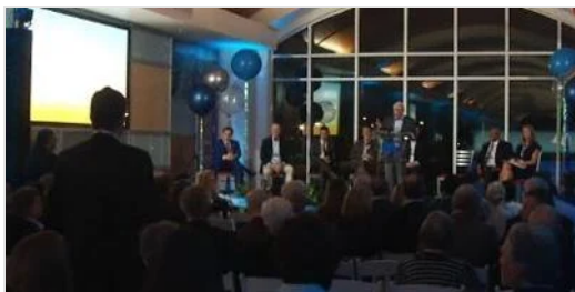
Chattanooga Airport celebrates new $28 million terminal renovation and expansion

The initiative also added new restrooms and concessions along with a business center that is powered by EPB's 10 Gig Wi-Fi.